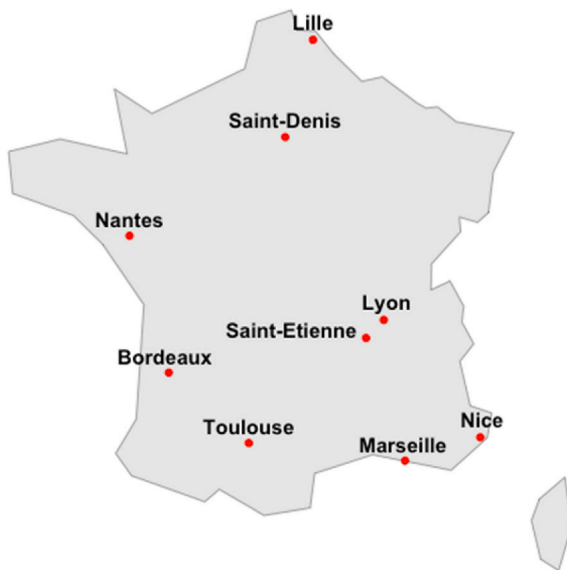
Fig. 1. Map of Locations in France with Rugby World Cup 2023 events.